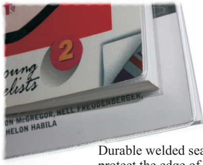
Durable welded seams protect the edge of the book.

Using the covers is simple - first slip the back cover through the two strips, then slide the front cover into the pocket. Slide the book back through the strips until taught, then fold the overhand under the strips.